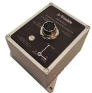
Trimble 147A Triaxial Accelerometer