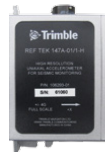
Trimble 147A Uniaxial Accelerometer